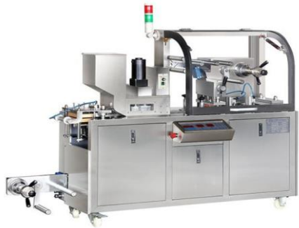
压板机 Blister machine