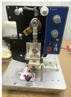
打码机 coding machine