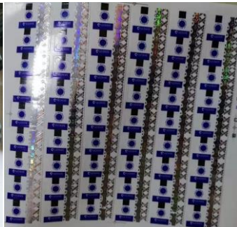
Security label 防伪标