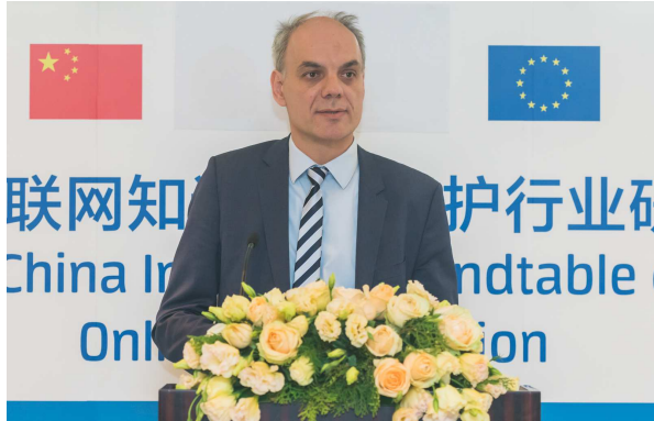
Beijing, New World Hotel