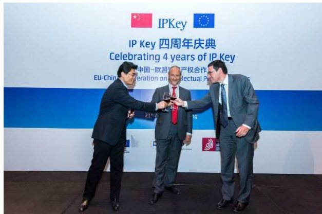
June 1-2, 2016