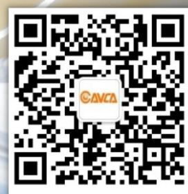
官方微信订阅号 WeChat Subscription Account