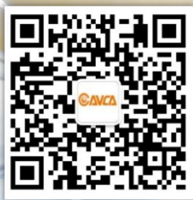
官方微信服务号 WeChat Service Account