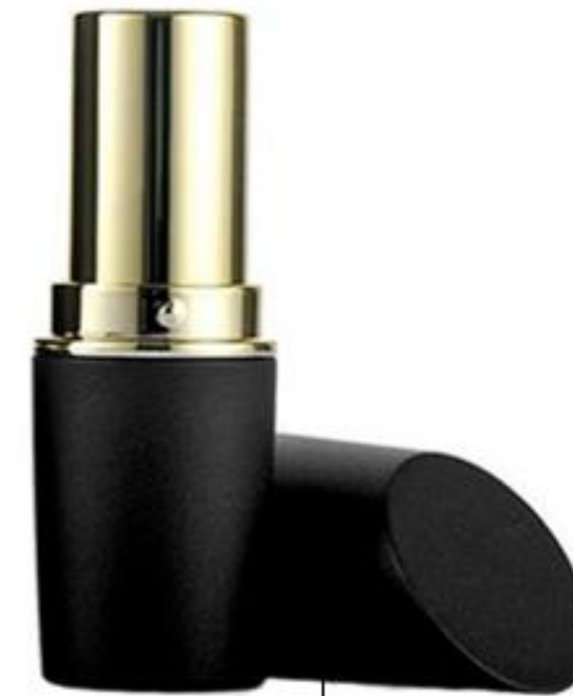
Lipstick tubes [packaging containers] 09-05