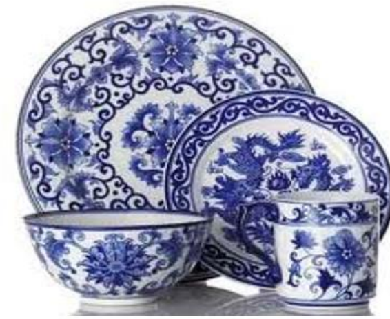
Porcelain (set of-)