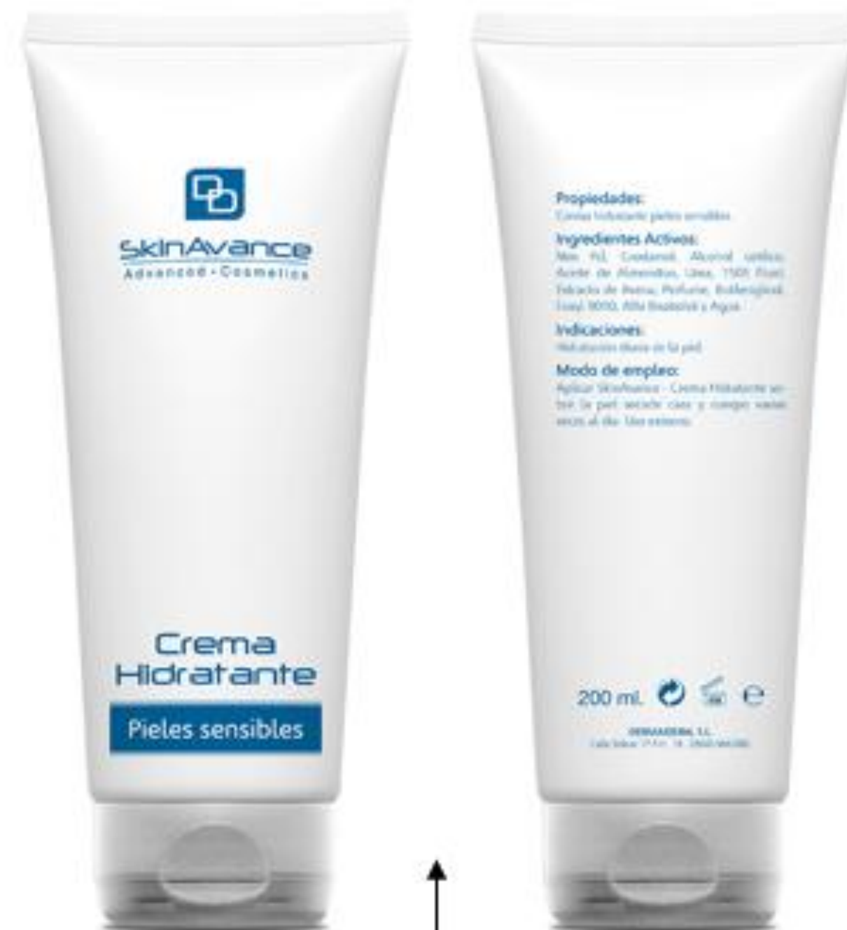
Cosmetic tubes 09-05