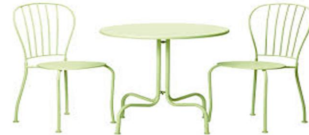
Furniture (set of-) 06-05