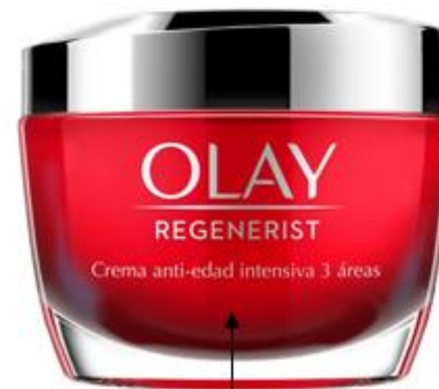
Cosmetic jars 09-01