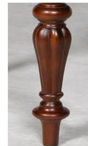
Tables (part of-) 06-06