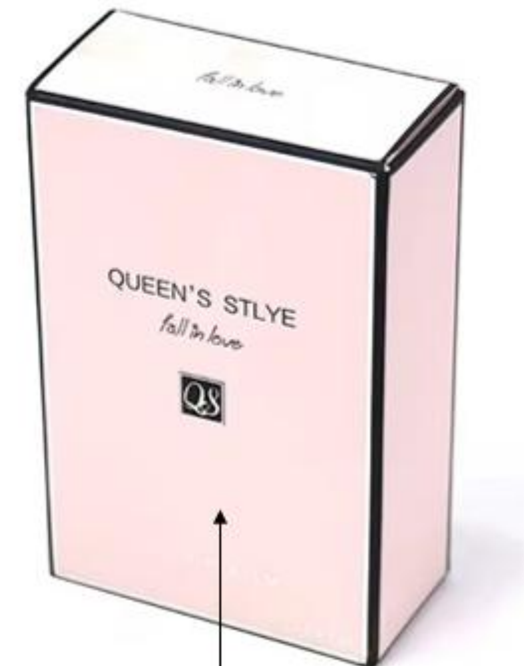
Boxes for perfume bottles 09-03