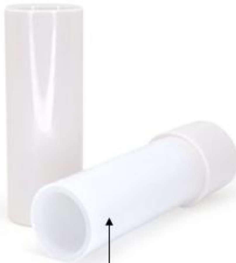
Lipstick tubes [packaging containers] 09-05